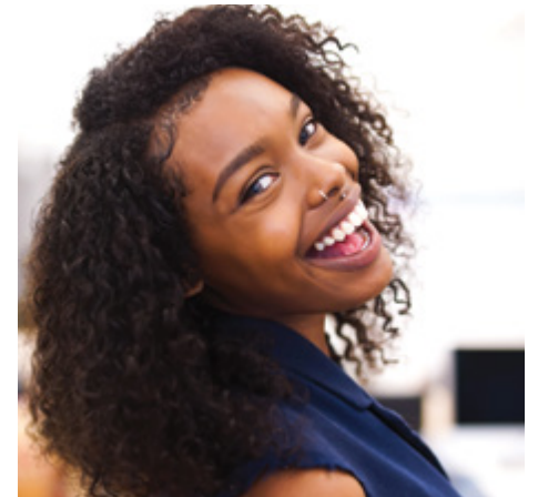
SMILING WOMAN

“As a future Black dentist, I know there are not that many Black dentists out there”