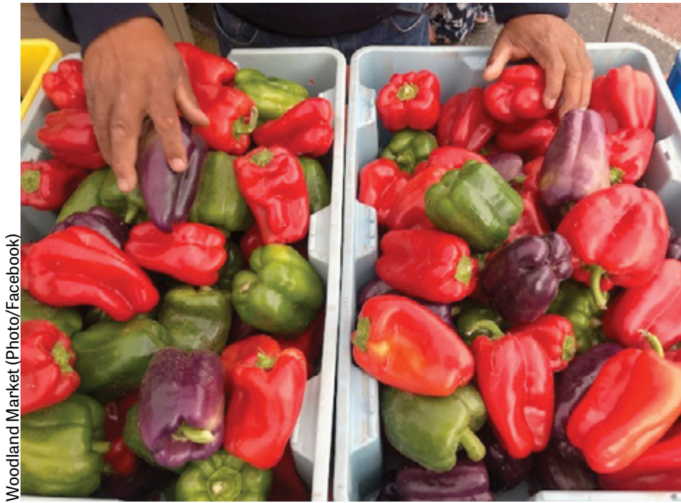
Woodland Market