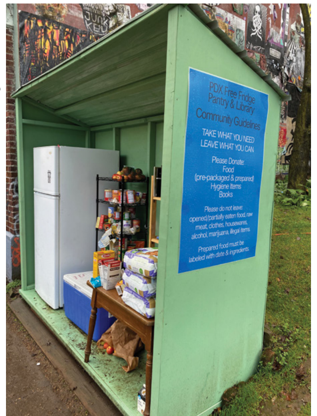
Portland Free Fridge