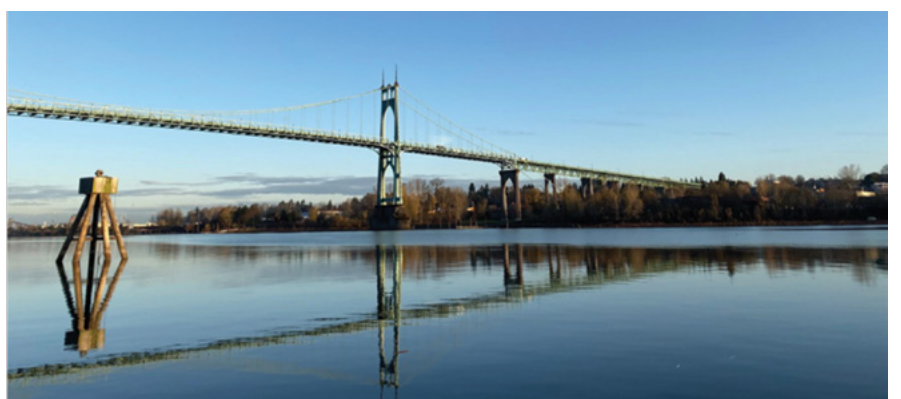
St. Johns Bridge, Portland

FOR MORE INFORMATION: To review the Collaborative Group's early Draft Charter, visit: https://bit.ly/3oddY14