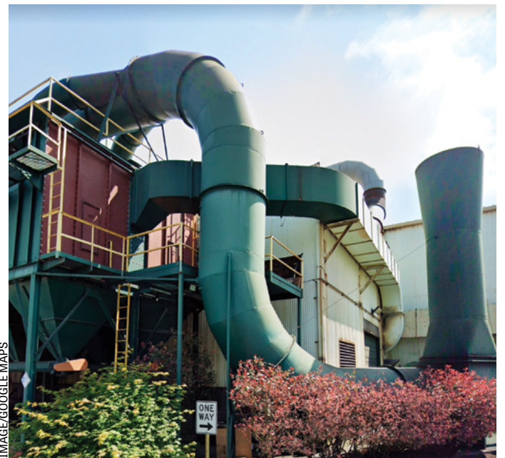
Columbia Steel facilities sits on an approximately 87 acre site in Northeast Portland.

shredder has prompted community outcry on the lack of air emissions data; local residents agitated at a public hearing in mid-December, and now the deadline for public comment has been extended to Monday, Feb. 8, 2021. Find out more about the process and the facility