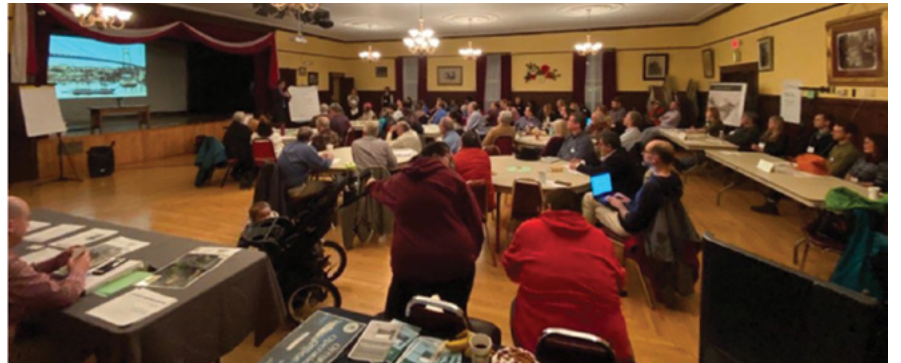
December 2019 Portland Harbor Public Forum

We are looking to recruit community members for the Portland Harbor Superfund Site Collaborative Group! The Site's website can be found at the following address: www.epa.gov/superfund/portland-harbor