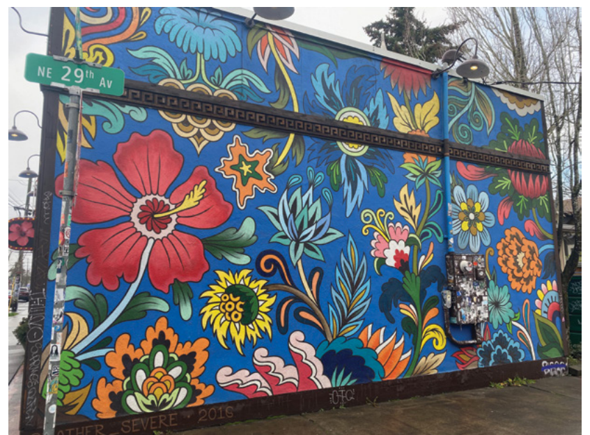
The Clary Sage Herbarium Mural by Rather Severe is one of the city's most popular spots to Instagram. 2901 NE Alberta St.