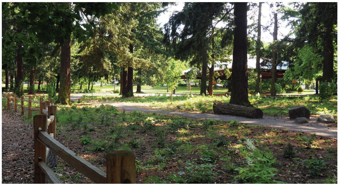
Photo of Alberta Park's nature patch is courtesy of Portland Parks & Recreation.

Capturing rainwater is especially important during storms to reduce flooding in nearby streets and to