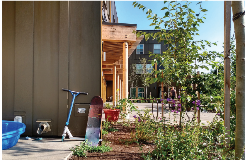
Nesika Illahee, at Northeast 42nd Avenue and Holman Street in Portland, features family-friendly patios and gardens.

She said it's important for Native tenants to feel comfortable, and also for the building to have a visibly Native pres-