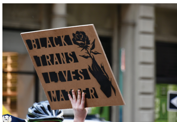
May Day 2017 in New York.