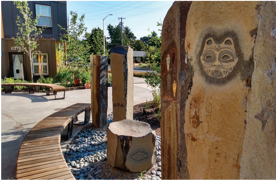
Patios at Nesika Illahee invite residents to sit and relax.